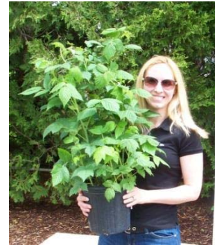
#2 Rubus 'Latham' (raspberry)

Visit Us at New England Grows February 1-3 2012