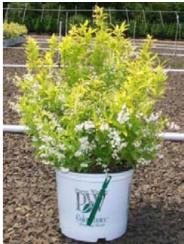
#3 Deutzia 'Chardonnay Pearls'™ PW

Make sure you are prepared! We still have a great selection of material available so please call your Baker/ Medford Sales Rep or Customer Service Re with any needs you still have for spring.