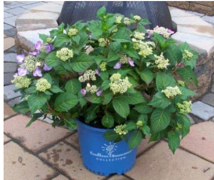
#3 Hydrangea 'Twist & Shout'™